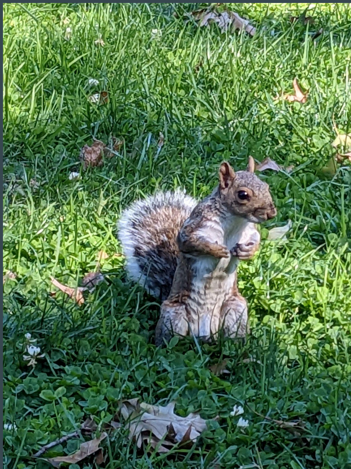
Photo - Author (taken by and also a reasonable likeness of my brain some days...)